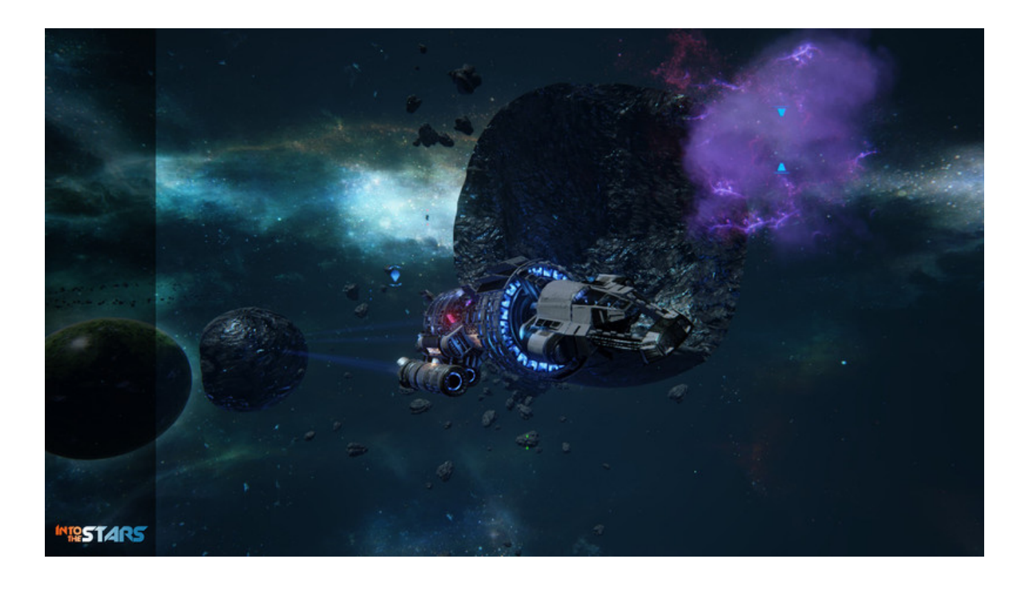
Into The Stars - Digital Deluxe Free Download Crack With Full Game